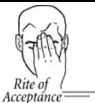
Rite of Acceptance

Please bring your food donations to Mass on the weekends between now and Christmas and put them in the containers provided.