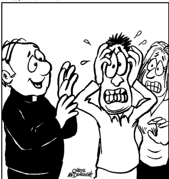
"Relax! I was just kidding! I'm not actually giving up short homilies for Lent this year."