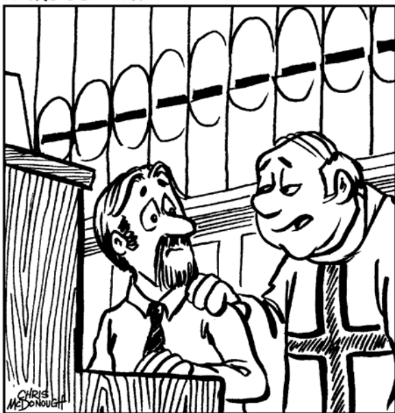
© 2002 World Library Publications, a division of J. S. Paluch Co., Inc.

"Even if you did go to school there, I'd prefer that you not play the 'Notre Dame Fight Song' for the postlude."