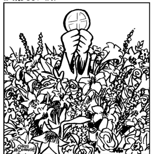
"Behold the Lamb of God... Happy is the one who doesn't have so many Easter flowers around the altar!"