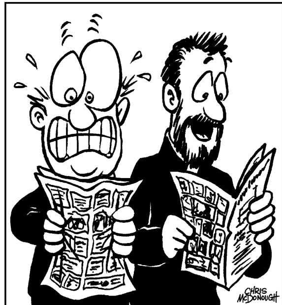
"Our new secretary is something... funny how a phone message from your doctor got in the Sunday bulletin."

© 2002 World Library Publications, a division of J. S. Paluch Co., Inc.