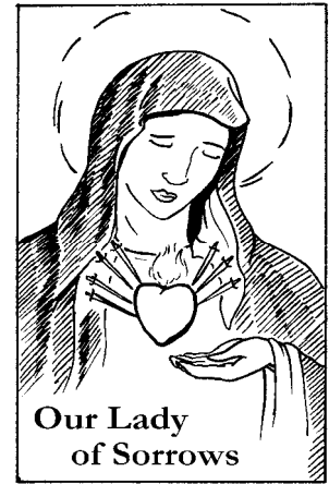
Our Lady of Sorrows