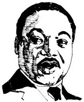
Martin Luther King, Jr.

Help Needed: 1) We need adult volunteers to paint the hallway of the school during the Spring Break (March 14-18). 2) We are still looking for someone to finish the job of replacing the doors on the front of the church. Two new doors need to replace the two bad ones and the kick guards need to be placed on all four doors. 3) As warm weather approaches, we need to power clean the covering over the side entrance to the church and the entrance to the school so we can get them painted and then work on getting the holes patched. 4) We need a team of people to do a deep cleaning of the hallways in the basement of the church and to paint the ductwork.