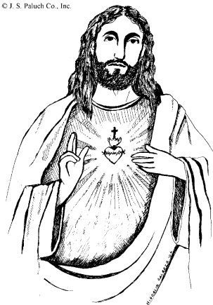
Most Sacred Heart of Jesus