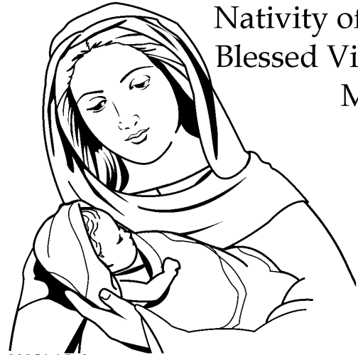
Nativity of the Blessed Virgin Mary